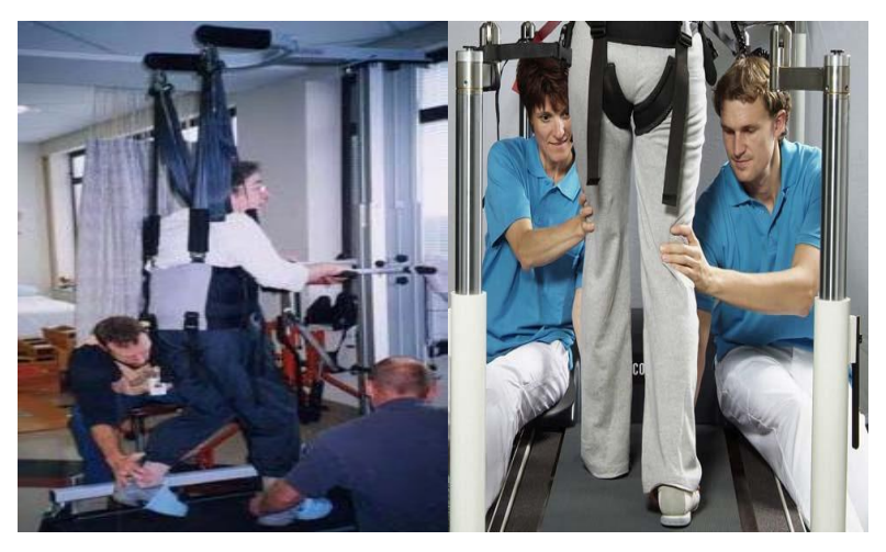
Static body-weight support